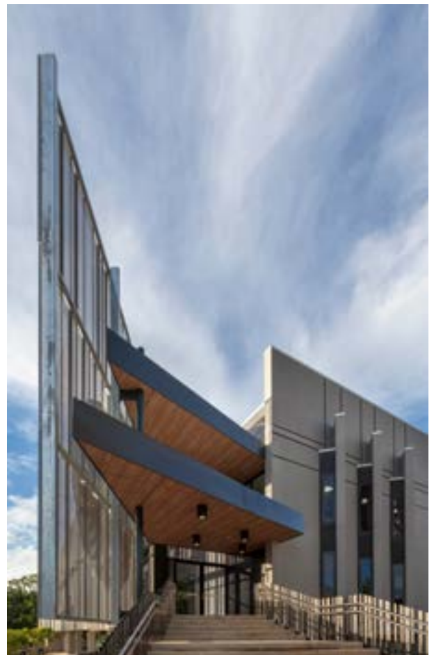
Image supplied by Burling Brown Architects. Photo – Rix Ryan Photography Qld.